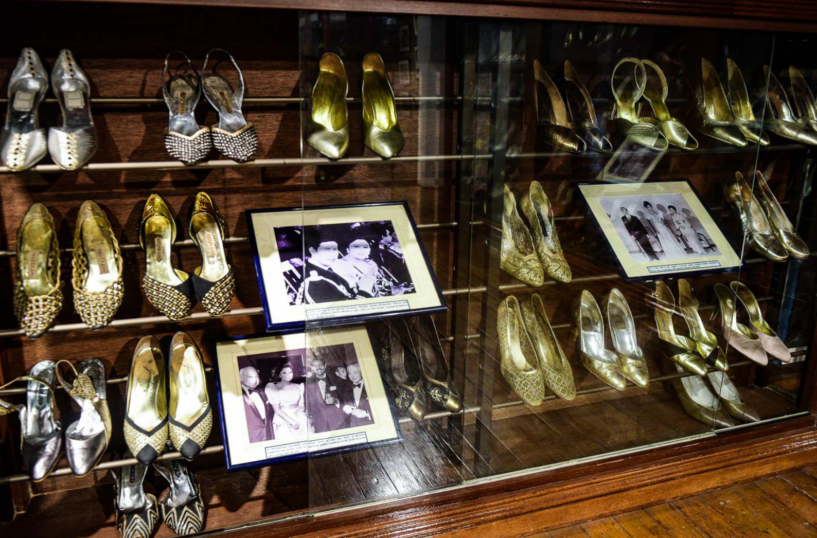
Museum holding the vast shoe collection of former First Lady of the Philippines, Imelda Marcos, implicated in extensive corruption involving hundreds of millions of dollars. Ferdinand Marcos, former President of the Philippines, was implicated in extensive and serious human rights abuses, resulting in a civil judgment of $2 billion in damages.

law. 1 Rather, it is framed as development support or aid. As a result, it fails to realise the rights of victims.