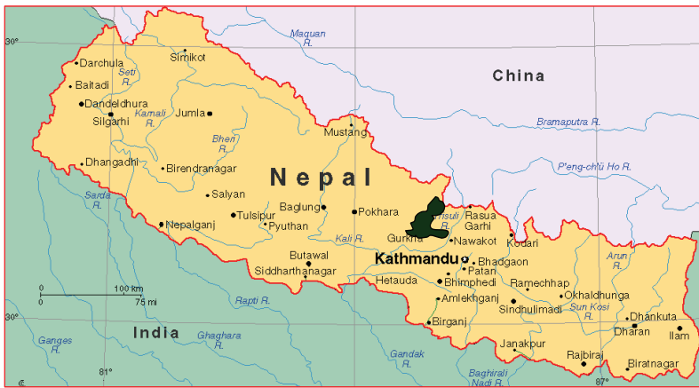
Figure 1: Map showing Dhading District

The historic neglect and discrimination against Tamang, Magar, various other ethnic groups and the Dalits, and a widespread frustration among the educated young men provided a support base for the Maoists insurgency in Nepal (Manandhar 2010). One popular expectation after the political change into a multi-party system in Nepal in 1990 was that electoral political leadership would bring desirable changes in the allocation of national resources and in the ways in which services are delivered. However, the change in the political system did not transform the centralized bureaucracy, nor increased the opportunity for local governance, nor challenged the prevailing social structure and institutions that reproduced inequality, locally and nationally. The Maoists claimed that ‘People’s War’ was inevitable as all attempts to carry out reforms within the old ‘semi-feudal’ and ‘semi-colonial’ system had failed.